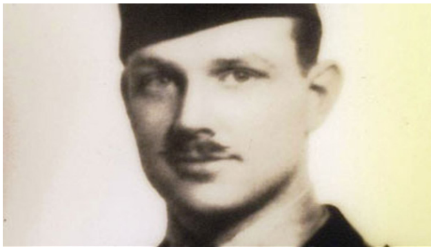
Charles H. Dolan